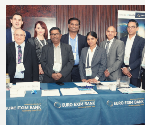
EEB GTR MENA TEAM