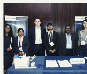
EEB INTERNATIONAL TEAM